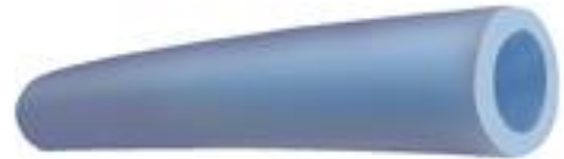
BLUE and BIG BLUE PE Conduit is easily cut to length with a sharp knife or razor blade.