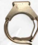
2 1/4" Barrel Grease Gun Holder