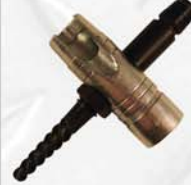
Grease Fitting Tool