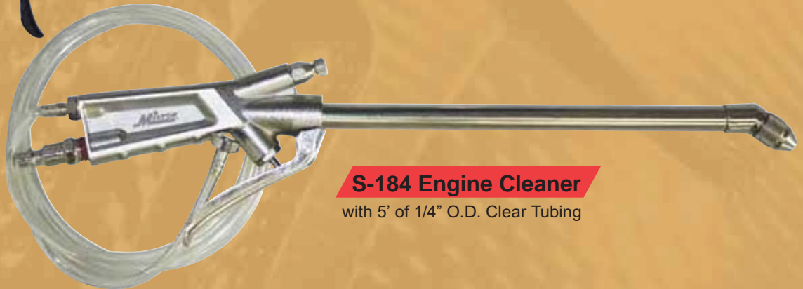
S-184 Engine Cleaner